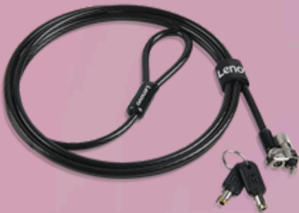
Kensington MicroSaver DS 2.0 Cable Lock from Lenovo 4XE1L68273