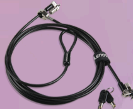
Kensington MicroSaver 2.0 Twin Cable Lock from Lenovo 4XE0N80915

Please click here to view the full list of accessories.