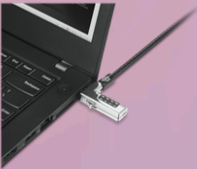
Combination Cable Lock from Lenovo 4XE1F30278