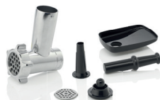
Meat Grinding Set