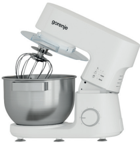
MMC800CW Series G200