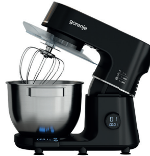
MMC1000SCB Series G600

Model with meat attachments and a blender that enables the preparation of perfect sauces.