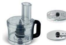
Food Processor + Discs