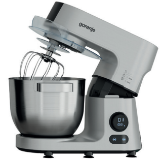
MMC1500SCX Series G800

Model, similar to the previous one with additional built-in scales for precise measurement of ingredients.