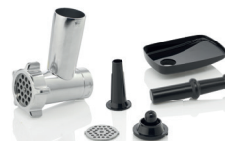
Meat Grinding Set