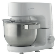
Series G200 MMC800CW