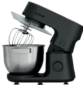
MMC1000CA Series G400

Model specialized for kneading dough, with 3 attachments for mixing, whisking, or kneading.